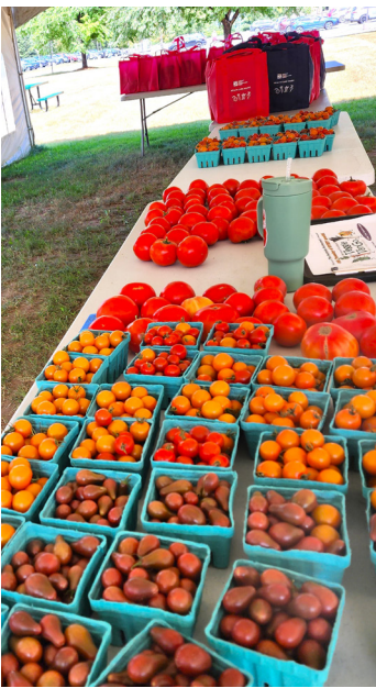
NCH philanthropic dollars support the Youth Conservation Corps summer healthcare share food distribution to patients.