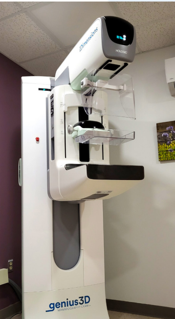
The hospital’s foundation was able to cover the cost of the Genius 3D Dimensions Mammography System ($436,000) through philanthropy