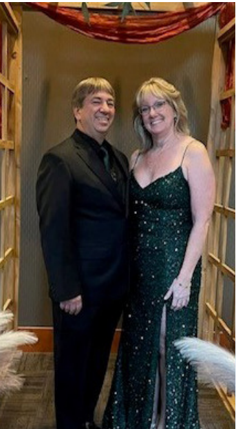
NCH’s signature event – the 12th Annual Moonlight Ball, raised $74,000, Benefiting the Patient Care Initiatives Program, to directly help patients in need.