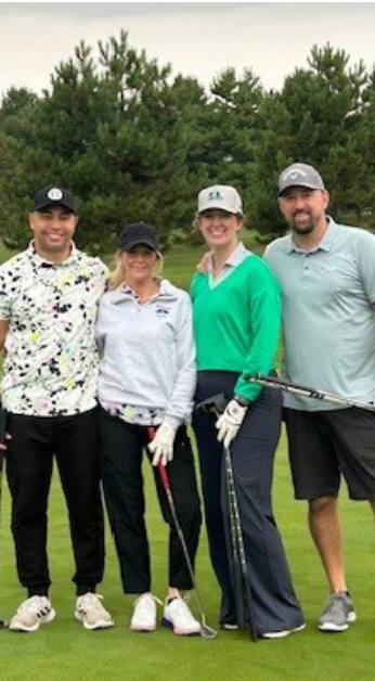
With the 37th Annual Scholarship Golf Classic and additional scholarship funds, the hospital awarded $32,500 in new and renewal scholarships in 2025.