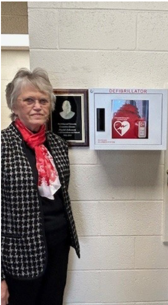
The hospital foundation has provided AEDs (automated external defibrillator) at 6 local nonprofits this year.