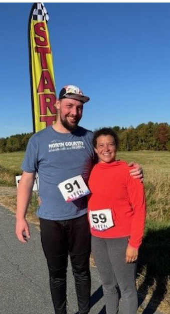
This family fun, free registration 5k on the 45th Parallel is a great way to come together on a crisp Saturday morning. Voluntary donations benefit our diabetes fund.